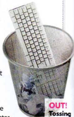
OUT! Tossing your tech

"Recycle them instead! Check out Best Buy's program—you pay $10 to recycle your TV, laptop or computer monitor and get a $10 gift card." —Heather Dale, editor, GeekSugar.com