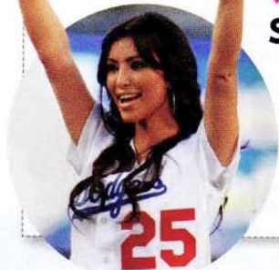
IN! Cheers & beers (Kim Kardashian)