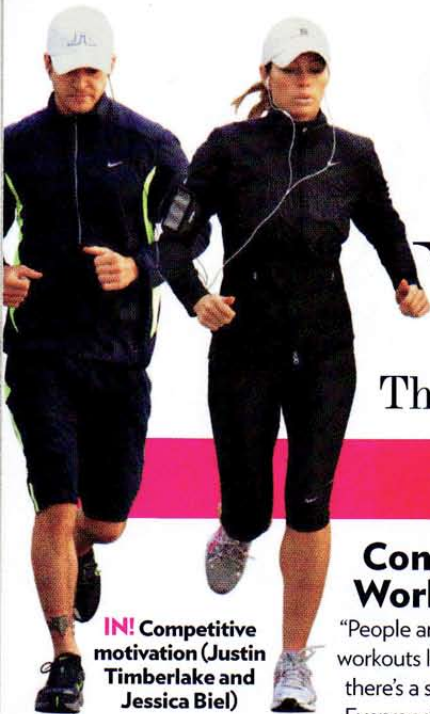
IN! Competitive motivation (Justin Timberlake and Jessica Biel)