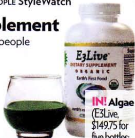
IN! Algae (E3Live, $149.75 for five bottles; e3live.com)